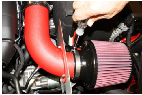
19. Attach and tighten NEUSPEED air filter using 8mm Nut Driver.