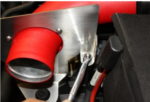
12. Install and tighten supplied acorn nut using 11mm wrench.