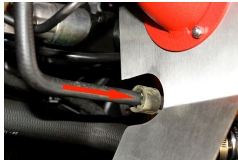
18. For extra protection, slide coolant hose protector sleeve just under P-Flo bracket.