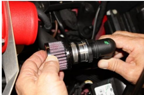
16. AIR PUMP ONLY: Attach mini filter to billet fitting and tighten. Then connect to air pump hose fitting.