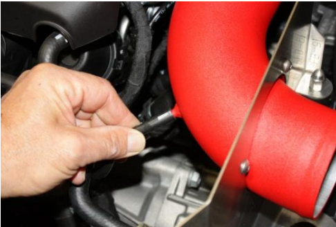
14. Connect vent line to NEUSPEED intake pipe.