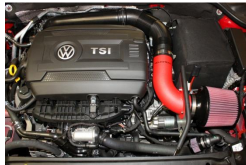
21. Double-check complete installation.

Copyright 2014, NEUSPEED ®. All rights reserved. Reproduction in whole or in part prohibited. DOC.65.10.49/48 Rev. 01.15.14