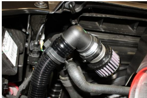
17. AIR PUMP ONLY: Attach supplied black plastic hose support clip from radiator coolant vent hose to air pump hose.