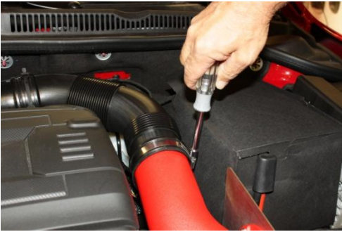
13. Tighten #48 hose clamp at intake pipe to inlet tube using 8mm Nut Driver.