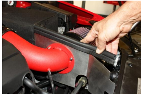
20. Install rubber strip on top-edge of P-Flo bracket.