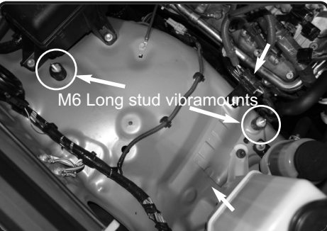
10. Using the OEM mounting locations, install provided long stud vibramounts to the thredded inserts. Make sure the long stud is facing up. short side is secured.