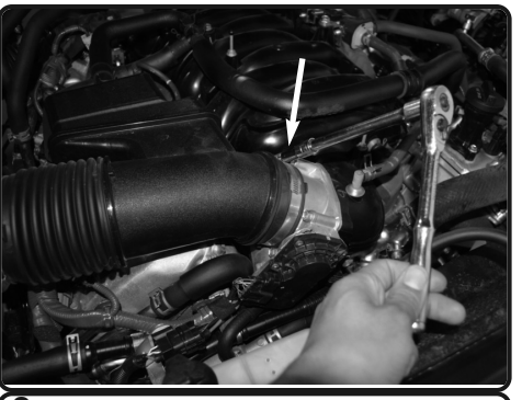
2. Lift up firmly to remove the engine cover. Loosen the clamp on throttle body using 10mm socket and ratchet.