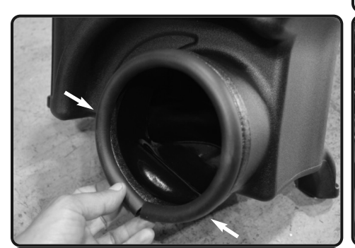
9. Install the provided Rubber trim to the hole cut out.