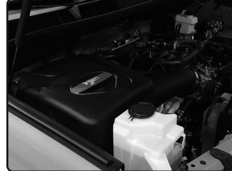
Congratulations! You have just completed the installation of this intake system. Periodically, check the alignment of the intake, normal wear and tear can cause nuts and bolts to come loose. Note: Check clearance and adjust if needed! Failure to check the alignment and adjust the intake can cause damage that will void the warranty. Injen Technology is not responsible for any damages caused by/from improper installation.