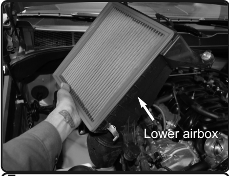
7. Remove the bottom half of the airbox out of the vehicle.