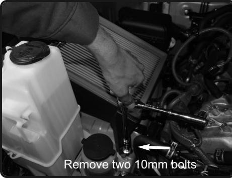
6. Locate the 2 bolts holding in the bottom half of the air box, loosen and remove.