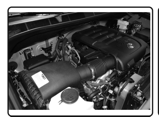
1. Stock intake system shown.