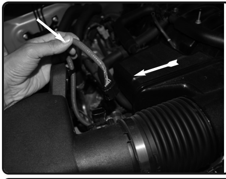
4. Disconnect the MAF sensor harness. Pull harness from the air box.