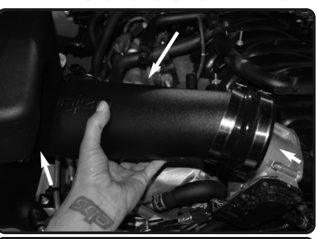
14. Insert the Injen intake tube assembly to the vehicle.