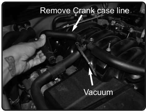
3. Disconnect the small vacuum line and remove the crank case line from the air box and engine.