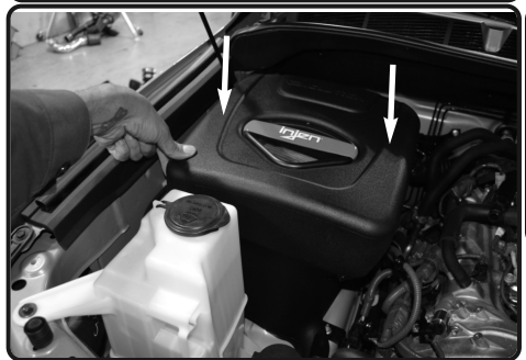
11. Place the Injen air box assembly into the engine bay and line up the pegs below the Injen air box to the vibramounts.