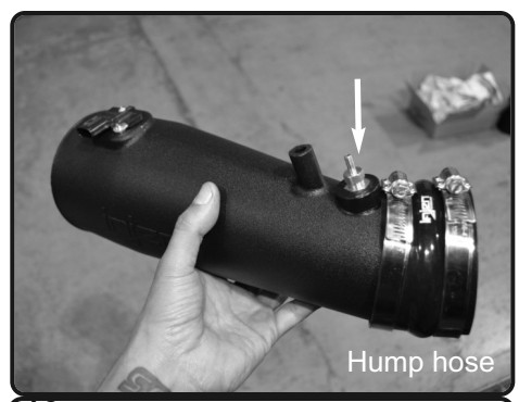
13. Install the 1/8" NPT fitting, to the insert on intake tube and secure. Install the 3-1/2" hump hose with clamps provided to the intake tube.