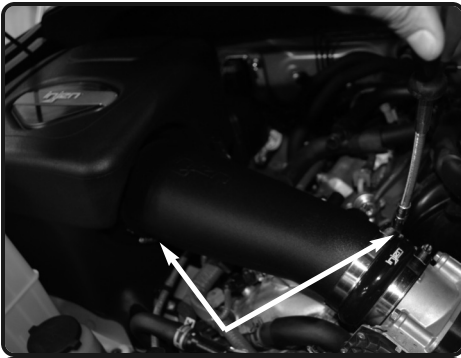
15. Adjust the intake for best fitment and then secure all the clamps. Tighten using 8mm nut driver.