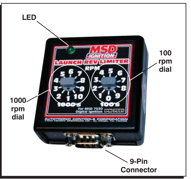
The Manual Launch Control.