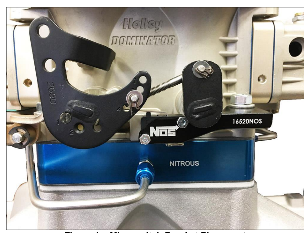
Figure 1 - Microswitch Bracket Placement

In your packaging, you will find the billet aluminum microswitch bracket, microswitch, and the mounting hardware for the microswitch. The 4500 series bracket typically installs on the driver's side rear carburetor stud ( Figure 1 ). Loosely install the microswitch to the bracket. Once installed, move the linkage to WOT (Wide Open Throttle) and adjust the microswitch to the desired engagement position. Tighten the carburetor nut and then the microswitch screws. Verify switch adjustment by moving the throttle linkage to WOT ensuring proper activation.