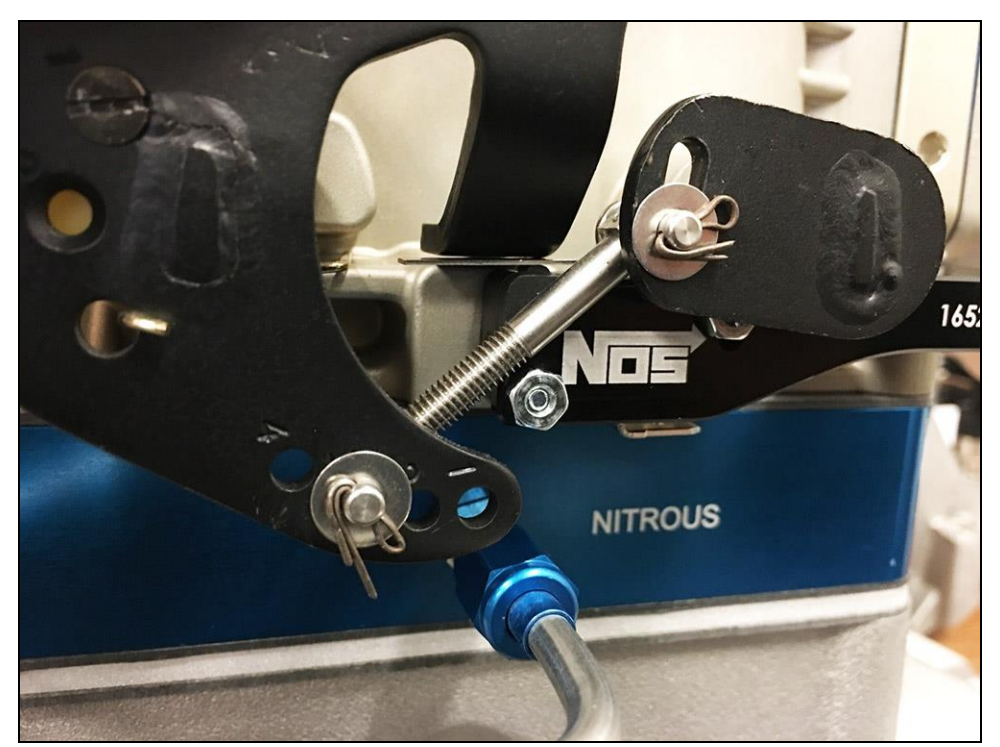
Figure 2 – Proper Microswitch Engagement at Wide Open Throttle