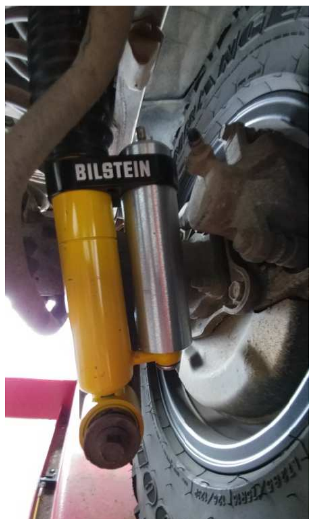
Figure 2 – RIGHT REAR