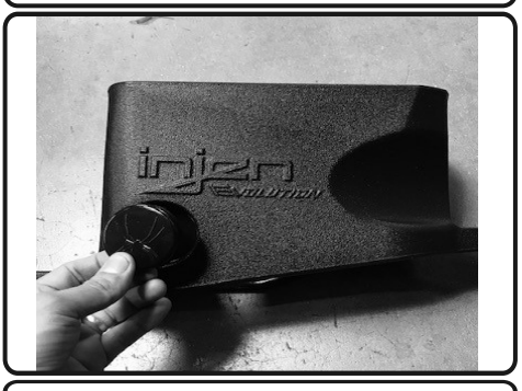
12. Install the Filter Minder plug into the Filter Minder hole located on top of the air box assembly.

11. Now install the grommets and washer-spacers to the new injen airbox.