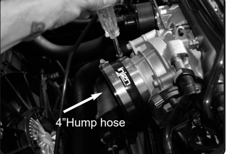
9. Install the 4" hump hose with clamps to throttle body. Tighten the clamp on throttle body only.

10. Remove the ractory grommets and washer-spacer out of air box. These will be used on new injen air box. Keep same finguration.