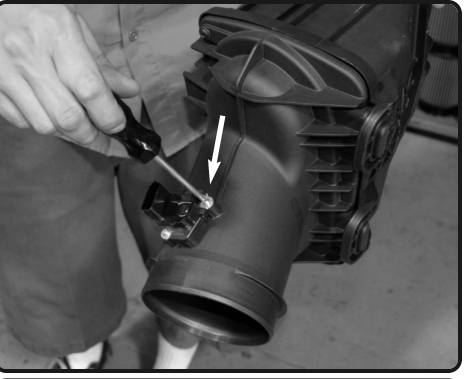
8. Loosen the 2 screws holding in the MAF sensor, remove the sensor.

7. Carefully remove the air box out of the vehicle.