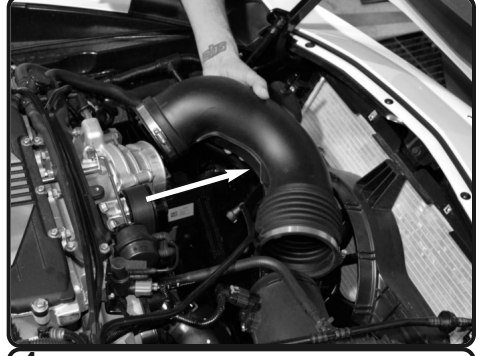
4. Now pull out the intake tube out of vehicle.

3. Loosen the clamps on the stock intake tube using 8mm nut driver.. Disconnect the crank case line on intake tube.