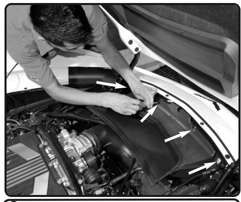
2. Use a 7mm nut driver to remove the four air vent screws. Remove the air vent from the engine bay for now.