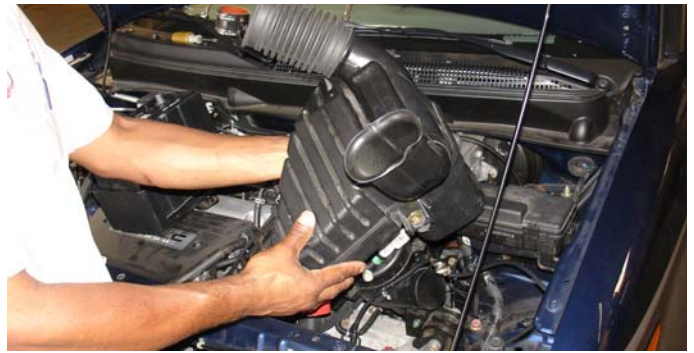
Note: For this installation, it will be required to remove the front bumper. Once the bumper has been removed continue to remove the stock air intake resonator from the bumper area.