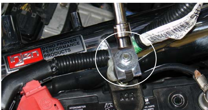
Place the m6 flange nut and fender washer over the intake bracket and vibra-mount stud. Take the m8 socket and Ratchet and semi-tighten the flange nut for now.