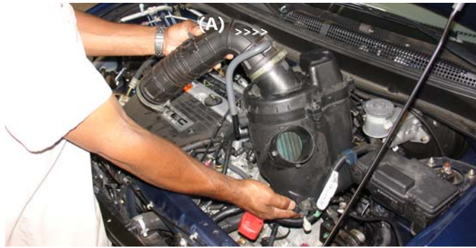
Loosen clamps and bolts in order to remove the air intake duct and air intake box from the engine compartment. Prior to pulling the air box out, remove the 8mm breather hose (A).