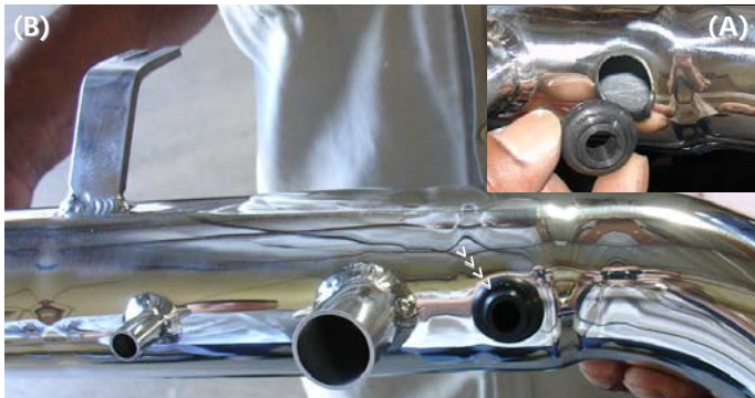
Take the 1525 sensor grommet at place it into the 3/4" pre-drilled hole (A). The sensor grommet groove will fit snug around the 3/4" holes edge (B).