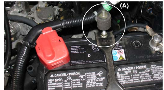
Screw the female vibra-mount over the battery post (A). Usually, 8 complete turns will be enough to level the intake bracket.