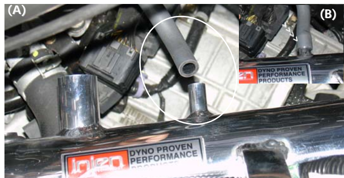
Insert the stock 8mm hose over the 3/8" intake port (A). Press the breather line just enough to hold itself in place (B).