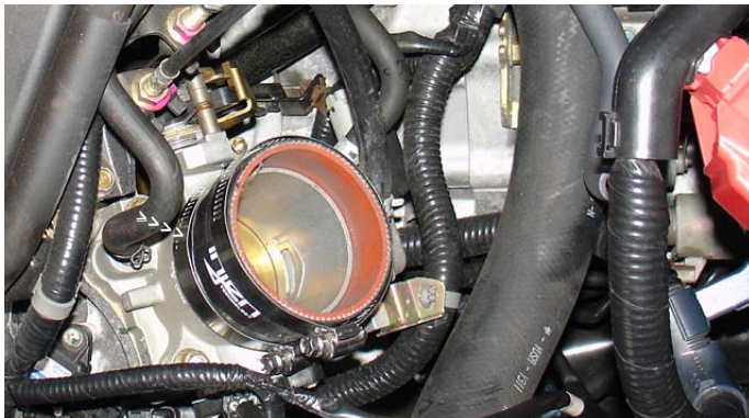
Press the 2 3/4" straight hose over the throttle body, place two clamps over the hose and tighten the hose on the throttle body side.