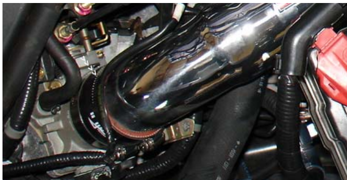
Press the intake throttle body side into the 2 3/4" hose. Align the intake bracket to the vibra-mount stud. Once the bracket has been aligned continue to semi-tighten the clamp on the intake.