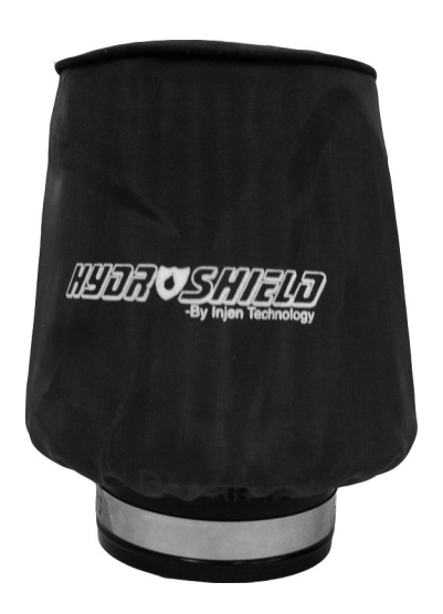
Hydro Shield Sold Separately