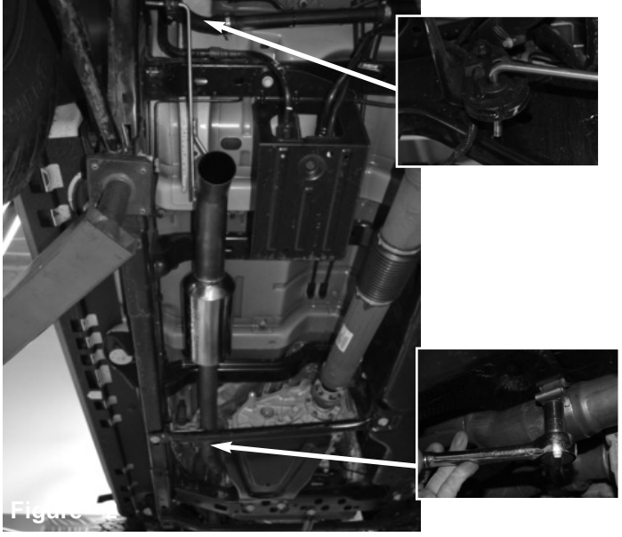
Make sure the hangars on installed to both the factory isolators. Position for the best fit. Rotate if necessary. Tighten the torsion clamp using 17mm socket and ratchet. Re-tighten after 50miles and verify the clamp is securred. Congratulations! You have just completed the installation of this intake system. Periodically, check the alignment of the exhaust. Note: Check clearance and adjust if needed! Failure to check the alignment and adjust the exhaust can cause damage that will void the warranty. Injen Technology is not responsible for any damages caused by/from improper installation.