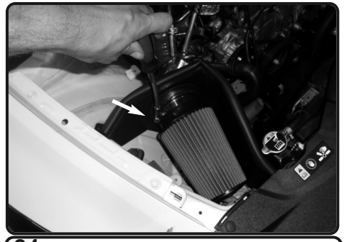
24. Install air filter and tighten using 8mm nut driver. Position for best fit, re-tighten and adjust if necessary.