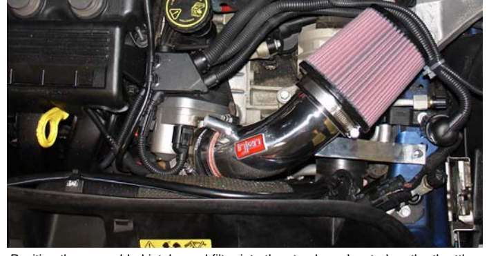
Position the assembled intake and filter into the step hose located on the throttle body. Align the intake for best possible fit. While the intake is positioned, place the bracket on the intake over the vibra-mount stud.