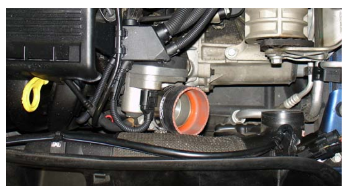
Take the short 2\ 1/2 " x 2\ 3/4 " step hose and press the 2\ 1/2 " end over the throttle body . Use one medium clamp and one small clamp. Tighten the clamp on the throttle body side at this point.