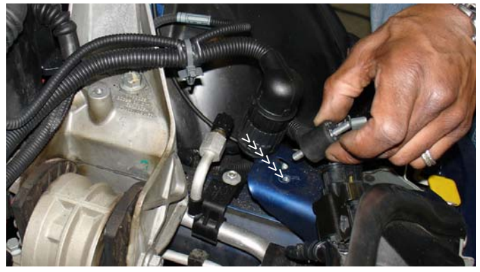
Locate the vibra-mount and screw it \, into the pre-tapped hole used to secure the stock air intake box.