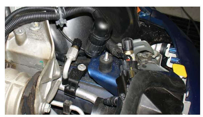
Screw the vibra-mount into the brace until it bottoms out.