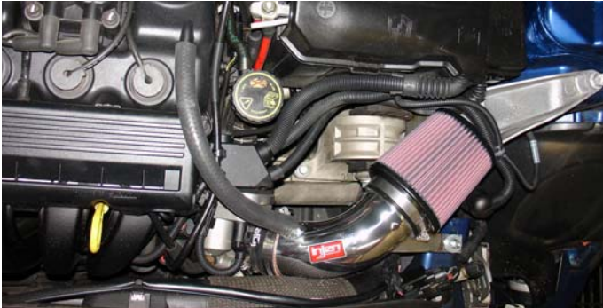
The installation is now complete. Check the entire intake to make sure there are no rubbing parts along the length of the intake then continue to tighten all nuts, bolts and clamps. Failure to check the intake periodically will void the warranty if any damage is caused to the intake.