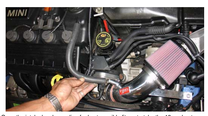
Once the intake has been align for best possible fitment, take the 12mm heat hose and press one end over the crankcase port.