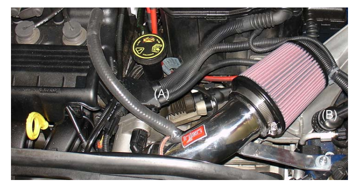
Press the other end of the 12mm heater hose over the intake port(A). Once again align the entire intake for best possible fit then continue to tighten the flange nut on the vibra-mount(B).