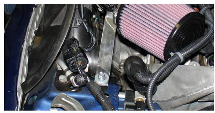
Take the flange nut and fender washer and secure the entire intake to the vibramount.