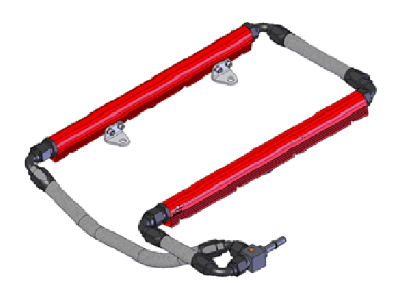
Example of a returnless fuel system plumbing

24. For returnless systems, feed the fuel rails with a Y-block for systems using braided AN line from the fuel pump or for systems using a stock supply line, use Aeromotive p/n 15116 Male Quick Connect to AN-08 T-Adapter. Build a crossover to connect the fuel rails together with AN line on the other end. Where clearance at the end of the rail is tight, Aeromotive offers p/n 15665 for AN-08 and p/n 15636 for AN-06 connections.