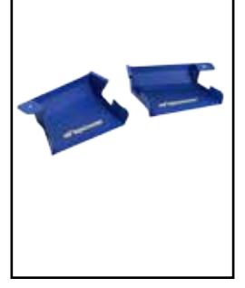
P/N: 54-11478 (Black) 54-11478-L (Blue) 54-11478-R (Red)