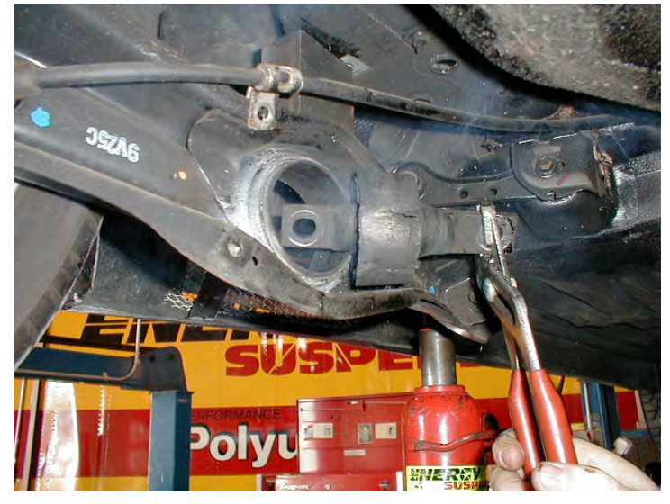
Step 2. Important Notes: Do not remove O.E. Outer metal shell. This shell is tapered on O.D.. Make note of which direction the cross pin is installed, this pin is offset! Bushing / pin removal. 1. Remove rubber bushing and / or pin from O.E. shell. (One example method to remove rubber bushing from O.E. shell is to use a hacksaw blade and cut bushing out. Note: All rubber must be removed from shell and clean for installation of new bushing.