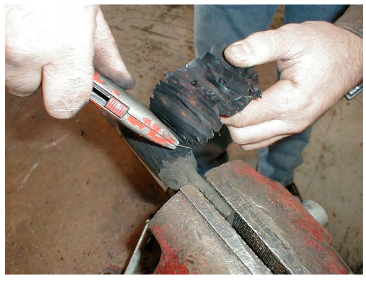
Step 3. Remove rubber from O.D. of cross pin. The cross pin must be completely free of all rubber . When using the method pictured above use <a href="Extreme Caution"><u>Extreme Caution</u></a>. Install cross pin noting the correct offset direction noted from step 2.