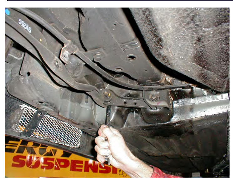
Step 1. Remove <u>outer</u> compensator arm <u>bolt only</u>. Remove two mounting bolts at cross pin, and parking brake cable retainer. At this time it is your discretion to remove complete trailing arm from vehicle to facilitate easier removal and installation of new polyurethane bushing or you may pull front of trailing arm downward.

1131 VIA CALLEJON, SAN CLEMENTE, CA 92673