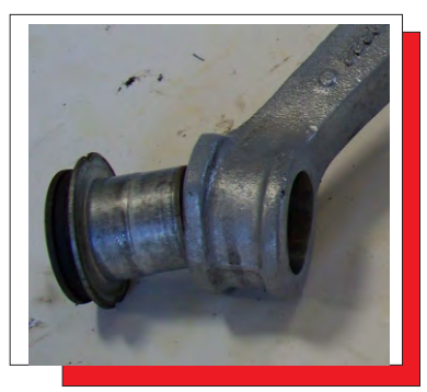
Factory bushing metal shell must be pressed out of upper control arm for Energy Suspension polyurethane bushings to fit properly.