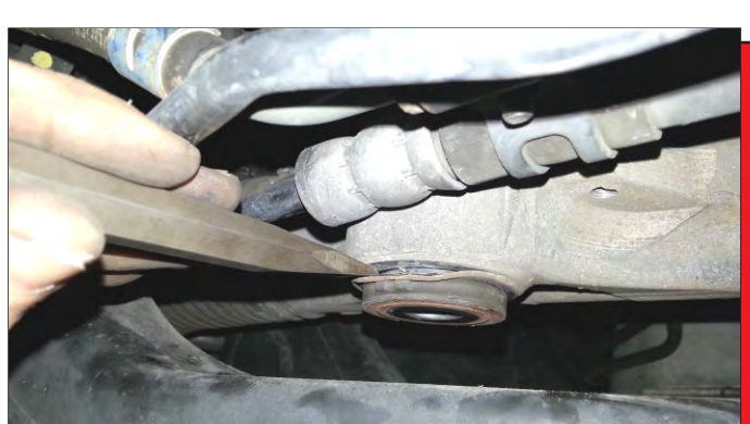
Passenger side: The rack will move toward the passenger side and forward just enough to remove the bushing. Use a Tie-Down strap to hold rack in place while removing bushing.