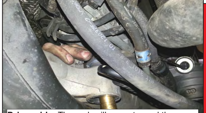
Driver side: The rack will move toward the passenger side and forward just enough to remove the bushing.